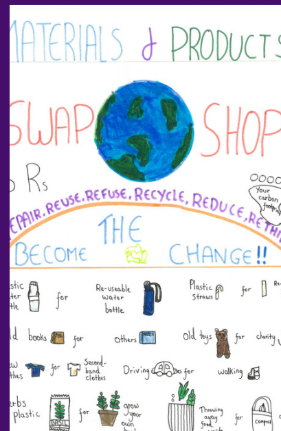
Our Winning Entries