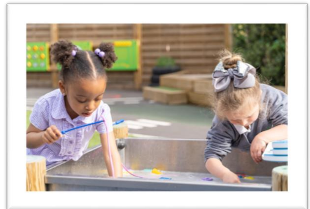
"Playing with my friend at Hazelbury Primary School"

We need to continue to prioritise our children and ensure Connect delivers on our core value of empowering our children to lead Remarkable Futures . As part of our Connect Education Trust strategy we have plans that will move us closer