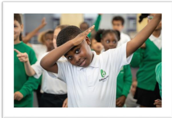
"Children dancing at Delta Primary School"