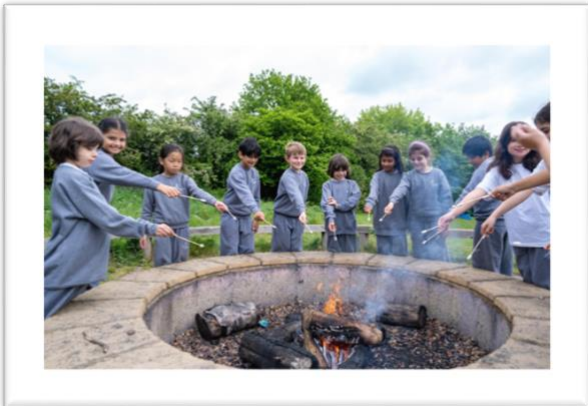
"Toasting marshmallows at Grange Park"