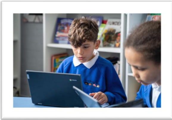
"Using our Chromebooks at Bowes Primary School"