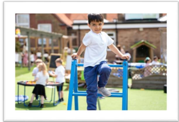
"Playtime at Chesterfield Primary School"